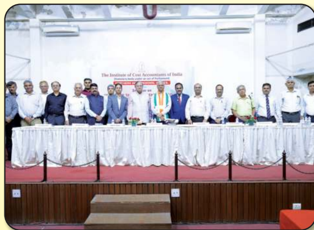
NIRC of ICAI organised the seminar on "Impact of Tax and Expenditure policy and Reforms on