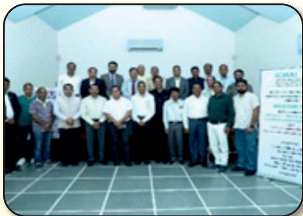
Seminar on changes in GST and Audit: 28th July 2024.