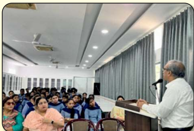
Carrier Counseling of Students on Oct. 2024