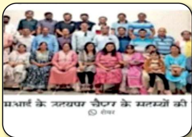
Study Circle Meet : 25th August 2024.