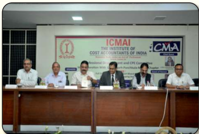
Viksit Bharat – 2047 on 08.06.2024