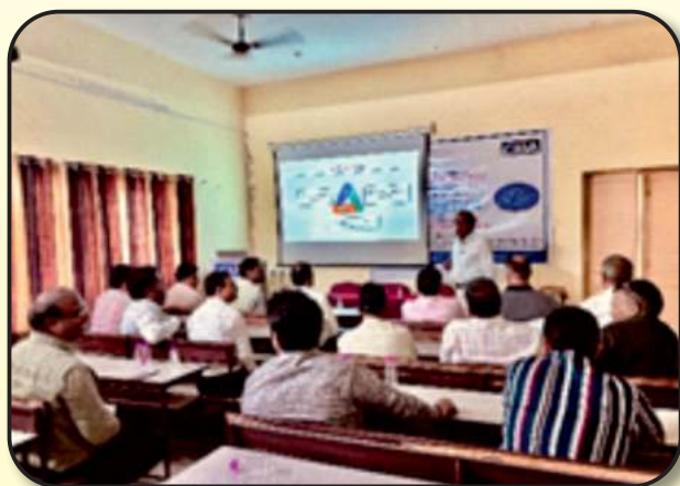
Seminar on Income Tax Bill 2025, Forensic Audit and Scope of Cost Audit- 16th March 2025.

Webinar jointly with other chapters Faridabad, Bhiwani, Beawar, Karnal- Panipat, Sonipat, Srinagar, Chandigarh-Panchkula-Mohali, Shimla, Ghaziabad, Nayanangal, Rewari & Udaipur on 15th February 2025.