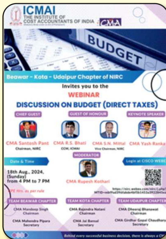
Webinar Jointly with Chapters Beawar, Kota, Udaipur – 18th August 2024.