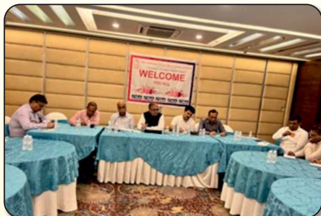
Decoding of Budget 27.07.2024