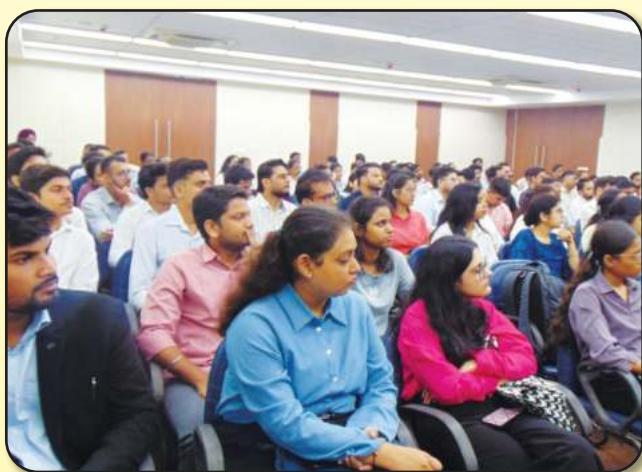
The Pre-Placement Orientation Programme was

conducted from 09.09.2024 to 20.09.2024 to prepare newly qualified CMAs for the upcoming placement drive organized by NIRC of ICAI. Throughout the programme, more than 140 candidates participated, a range of experienced professionals from various fields were invited to share their insights on real-world corporate practices and guide the young CMAs on how to effectively navigate job interviews and excel in workplace environments.