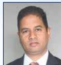
SECRETARY & TREASURER