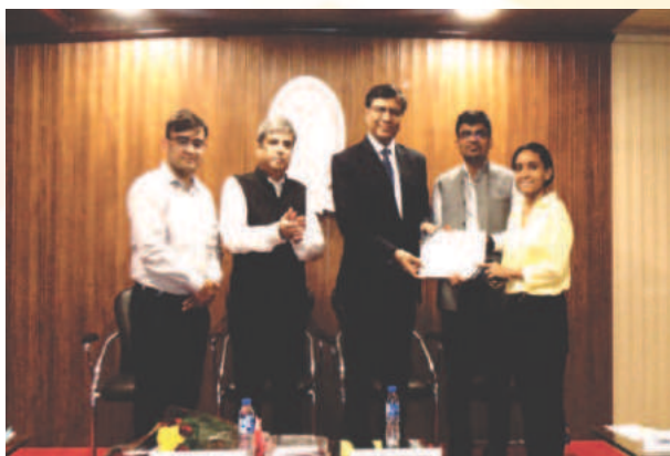
Faculty Felicitation Program on 21.11.2022

Passed students (June 2022 term) on the same day at NIRC Basement Hall.